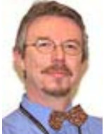
Layout, and photo: Jean-Luc Peysen