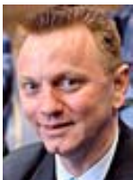
Editor: Ian Andersen. Phone: 54024.

DG SCICNEWS is published by the Communication & Information Unit of DG Interpretation.